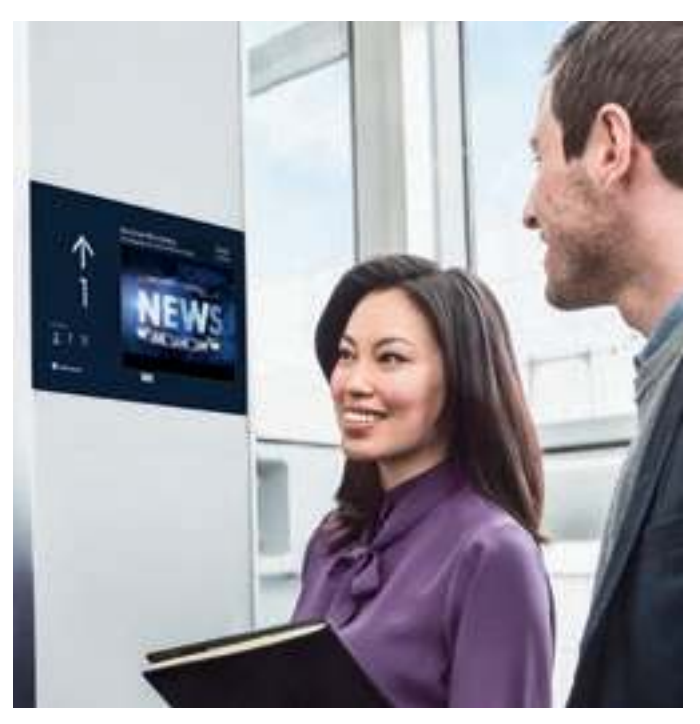
The KONE InfoScreen is an open channel of communication between you and elevator passengers.